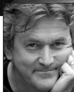
Johan de Meij Composer